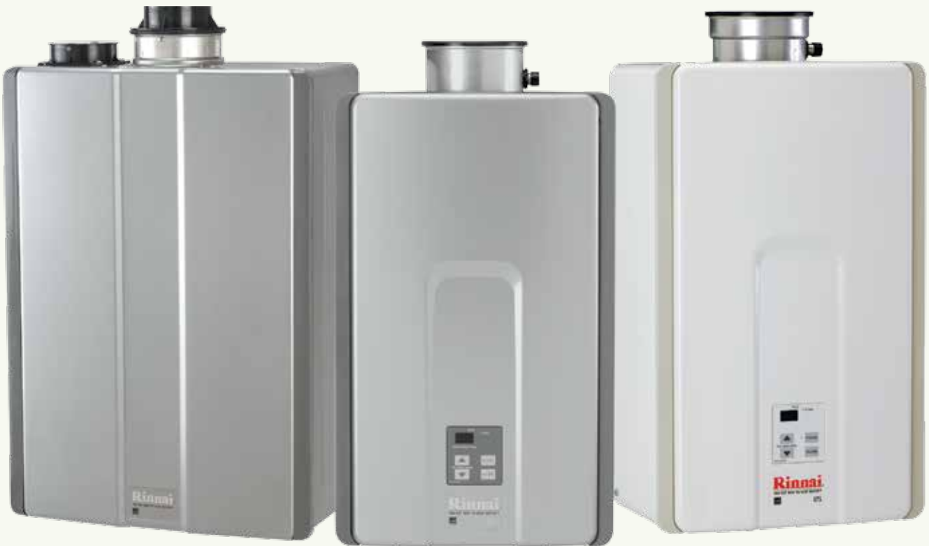
Tankless water heaters, such as this model from Rinnai America Corp., are helping homeowners save big on energy bills.