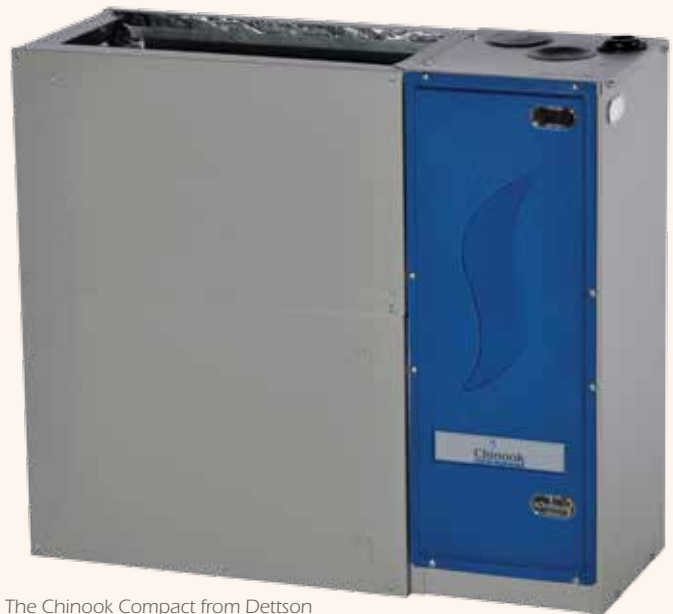
The Chinook Compact from Dettson is part of a new breed of high efficiency natural gas space heaters.

efficiency via its AirFlex technology that allows the local dealer to adjust airflow to best match a specific lifestyle, home design and geographic location. When paired with the Lennox iComfort S30 thermostat, the SLP98V adapts to the routine of the home and adjusts temperatures accordingly.