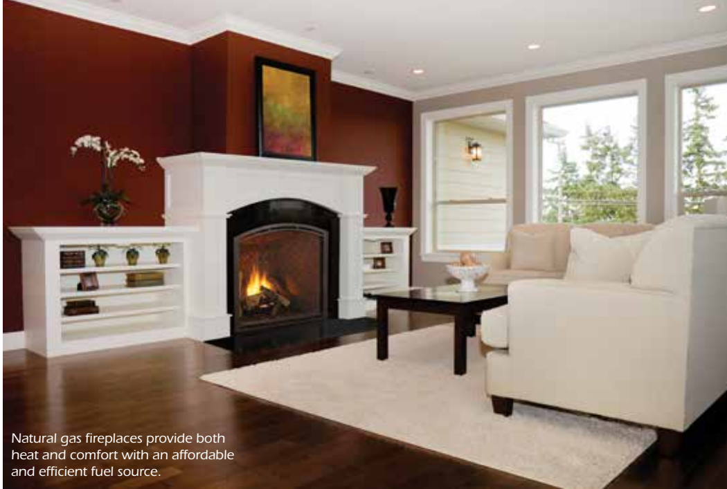
Natural gas fireplaces provide both heat and comfort with an affordable and efficient fuel source.