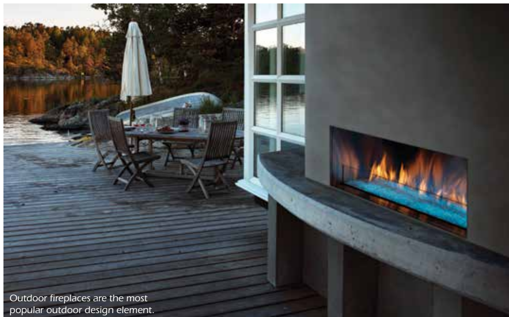
Outdoor fireplaces are the most popular outdoor design element.

With flexible venting options, direct venting fireplaces and gas inserts, consumers have many choices for bringing in the warmth of a natural gas fireplace into their homes. ■