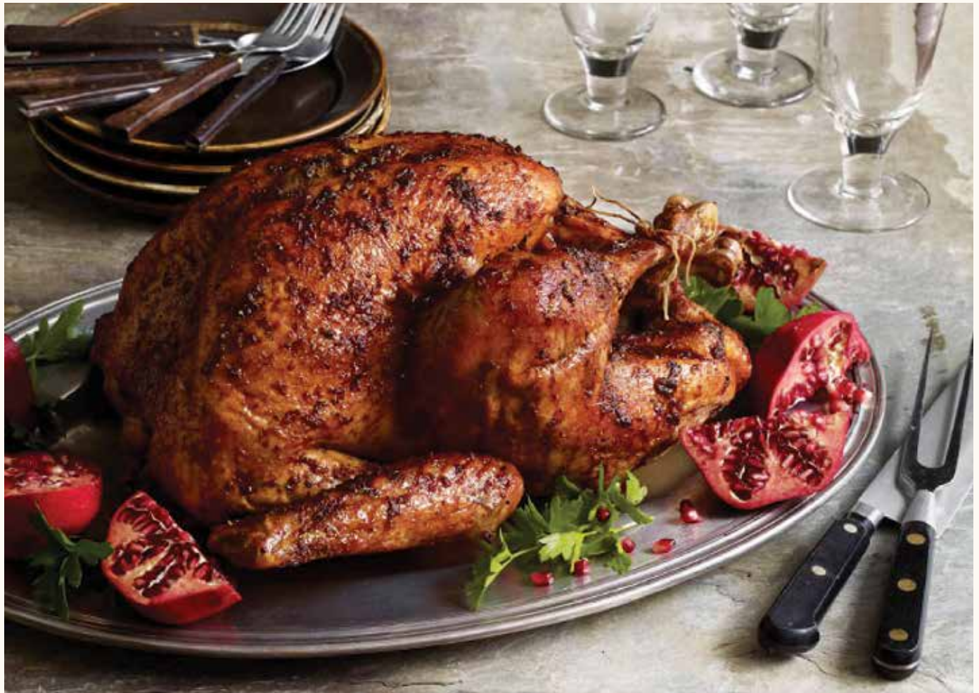
RECIPE COURTESY OF BOBBY FLAY