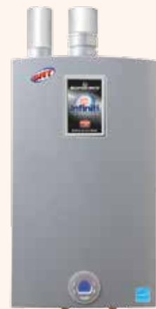
Bradford White Corp. offers a wealth of water-heating options. The High Efficiency Bradford White Infiniti Tankless Water Heater Series, for example, includes a method of pre-heating incoming cold water. The result is a continuous supply of hot water.

But regardless of the model selected, natural gas appliances are more than three times cheaper to run than electric models, according to the U.S. Energy Information Administration. It makes sense, therefore, to select natural gas over an electric water heater every time.