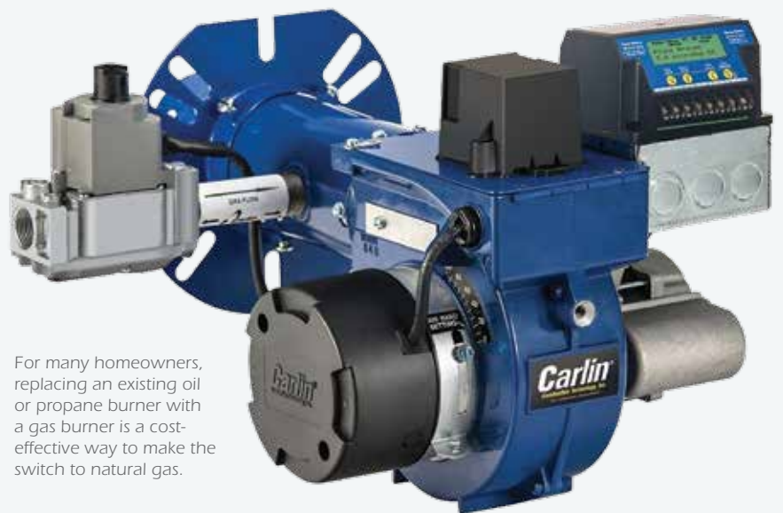
For many homeowners, replacing an existing oil or propane burner with a gas burner is a cost-effective way to make the switch to natural gas.

“It is essential that the combustion testing be done so that the unit functions properly and safely,” Graham said. “Customers should make sure the contractor has combustion testing equipment. Some contractors may