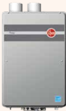
Rheem Manufacturing Co.'s Prestige Series condensing tankless gas water heaters include a water savings setting that can save up to 1,100 gallons per year.

Bradford White offers a wealth of water-heating options. The High Efficiency Bradford White Infiniti Tankless Water Heater Series, for example, includes a method of pre-heating incoming cold water. The result is a continuous supply of hot water. These water heaters not only supply endless amounts of hot water, but they do so in a way that is good for the environment in